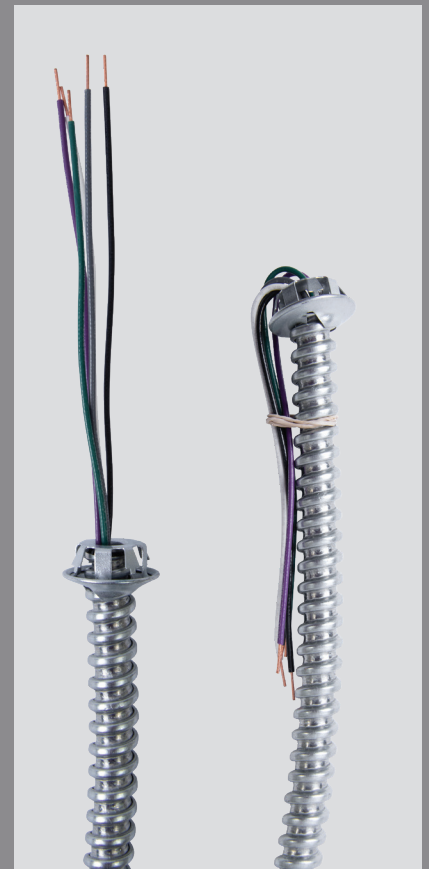
Figure 1 Shown with Standard Snap-In Connector

Bergen's ICFW's are used for combining Power / Lighting Circuits (black/white/green) with class 2 or class 3 Control Circuits / dimming ballast & digital controls (purple, gray) all within the same fixture whip. Easy to install & color coded to reduce installation error. Meets UL & NEC Requirements. (See Figure 1)